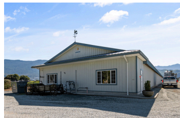
EXTERIOR BARN 1