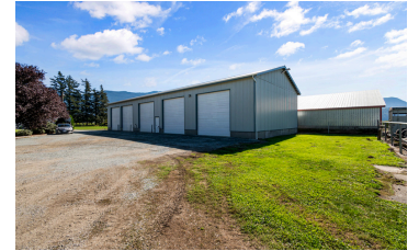
EXT. NORTH SIDE SHOP