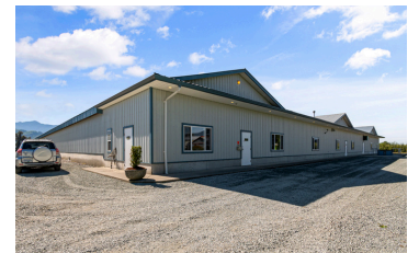
EXTERIOR BARN 2 & 3