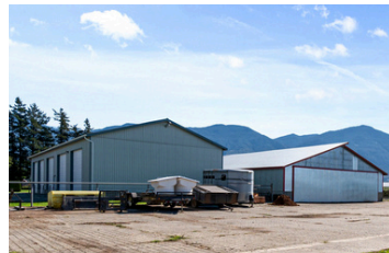
EXT. WEST SIDE SHOP