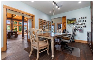
OFFICE / CRAFT ROOM