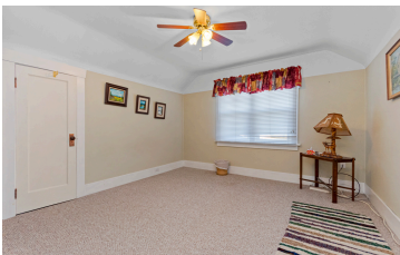
UPPER FLR BEDROOM